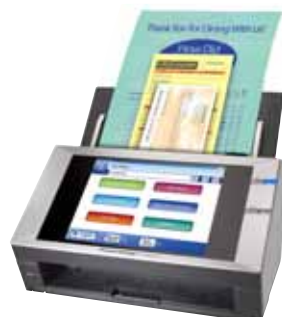
ScanSnap N1800 Network Scanner