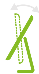
Tilt Angle -5° TO 25°

From CAD users to financial analysts, everyone can find the model that fits their viewing demands in our range of stylish and ergonomic monitors. Designed for professionals that spend significant amounts of time in front of a computer, they offer easy height, tilt, and pivot adjustments to enhance comfort over prolonged periods of use. Our monitors also incorporate Acer EyeProtect, a suite of features designed to reduce eye-strain and provide a more comfortable viewing experience to heavy users such as programmers, writers, and graphic designers.