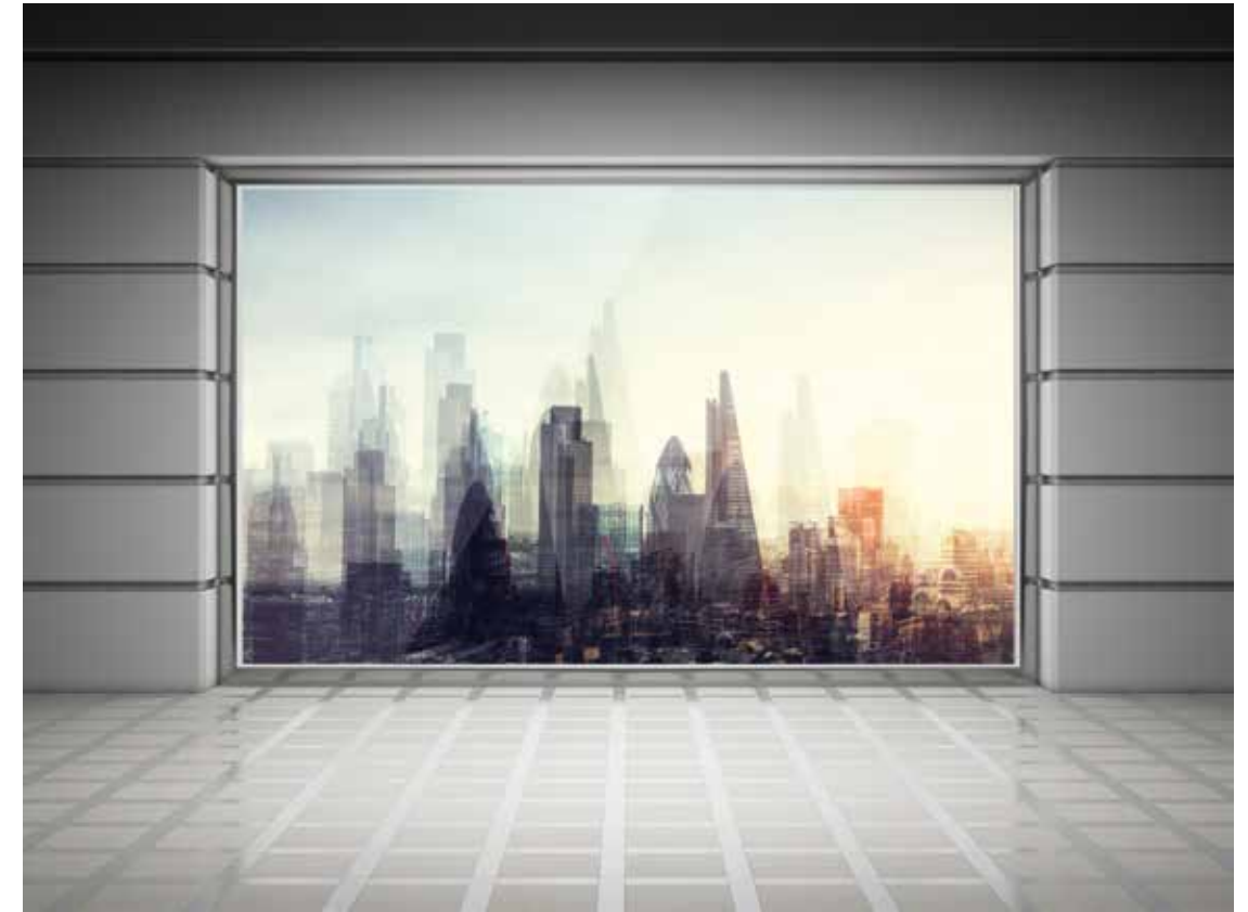
3x3 (9 LFD) display

ACER PROFESSIONAL MONITORS ARE DEVELOPED TO FULFIL THE NEEDS OF THE MOST INTENSIVE BUSINESS USERS, COMBINING THE LATEST DISPLAY TECHNOLOGIES WITH SMART ECO FEATURES FOR LONG TERM QUALITY VIEWING.