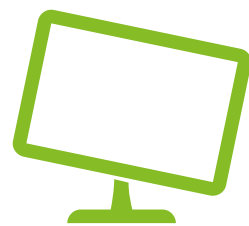
Pivot angle 0° TO 90°