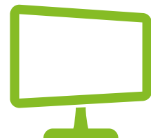
Swivel angle 120°